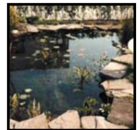
Greenmax EPDM pond liner applied for a guaranteed long-term waterproof basis.